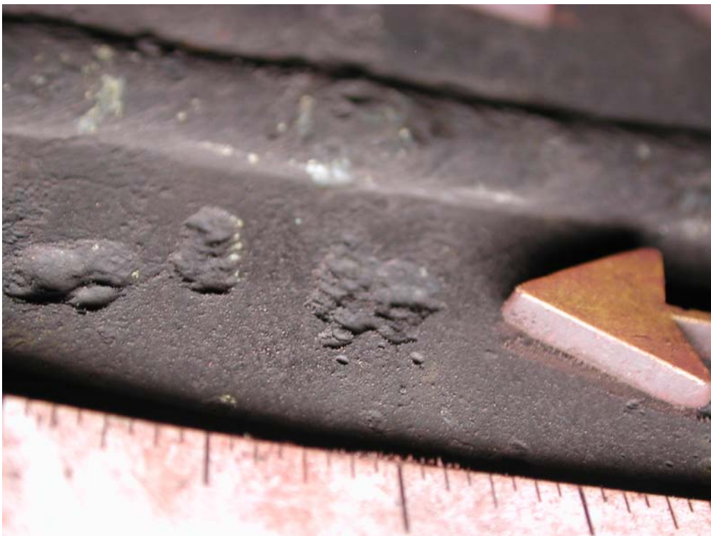
Detection and proper evaluation of internal corrosion is critical in pressure vessel inspection.